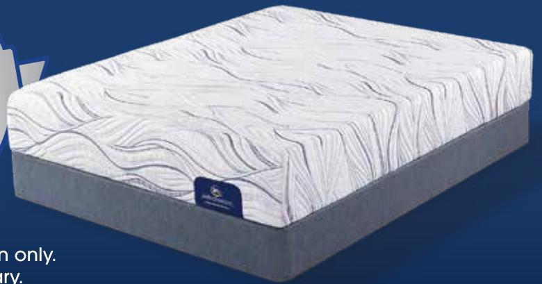
Photos shown for illustration only. Actual product may vary.